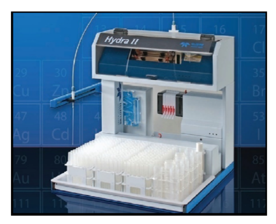
Figure 1: The Hydra II AA

The analysis was performed using the Hydra II AA shown in Figure I. The Hydra II AA includes an extended range spectrometer, a high-capacity autosampler, variable speed peristaltic pump, serpentine gas/liquid separator, and flow-through rinse. The tri-cell optical design allows the analyst to select the optimum system sensitivity, achieving either part-per-trillion detection limits or linearity in excess of 1 part-per-million. This flexibility delivers optimum results for both clean water and contaminated soil analyses. The autosampler design addresses issues of recurring QC volume with built-in reservoirs for repetitive checks and sample capacity with up to 270 sample locations available. Its 5-channel peristaltic pump precisely delivers sample and reductant solutions under computer control while actively removing system waste