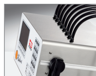
Abakus mobil air with 8-fold measuring point toggle