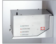
Option: Wall holder for PCSS air