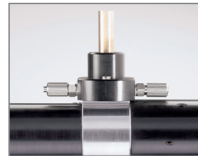
Sensor with air purge for dust measurements and filter test stands