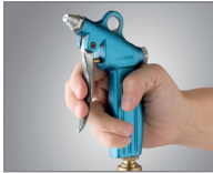
Particle counter for compressed air