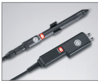
Nozzles: C°, %rF, m/s pressure differential