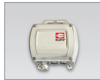
Network box for humidity and temperature sensors