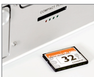
CF card memory