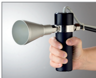
External sensors for the measuring range 5-500 µm