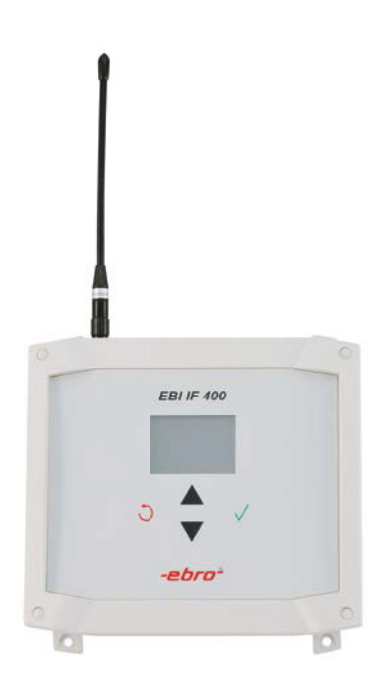
EBI IF 400 – Interface including antenna