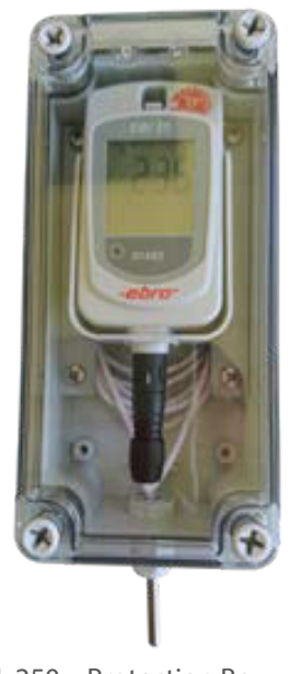
AL 250 – Protection Box for EBI 25 TE and TX