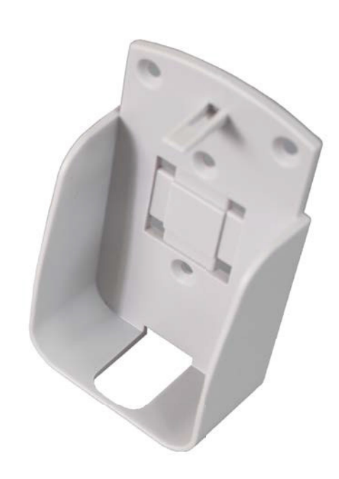
AG 152 – Wall mount for EBI 25