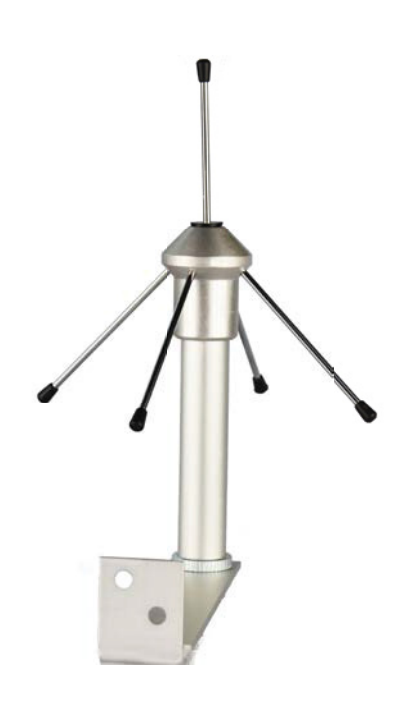
AL 116 – external antenna for the interface EBI IF 400 interface for more power, optional