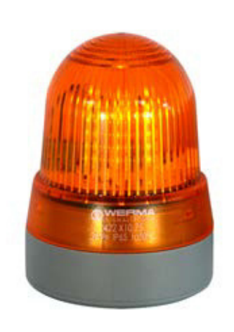
AL 251 – orange Flash Light and buzzer combination