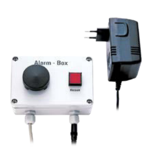
EBI 2 AB-2 – Alarmbox to connect to interface IF 400