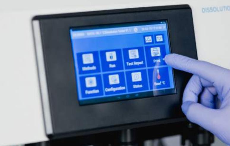
7" colour high resolution Display with touch screen interface