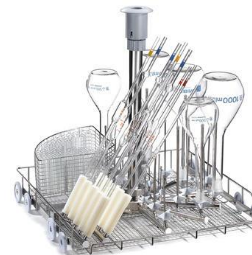
WASHING TROLLEY FOR FLASKS / PIPETTES / TEST TUBES - 20 POSITIONS