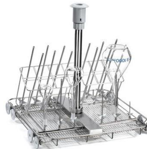
TROLLEY FOR FISCHER TUBES

TWO LEVEL INJECTION TROLLEY FOR TEST TUBES