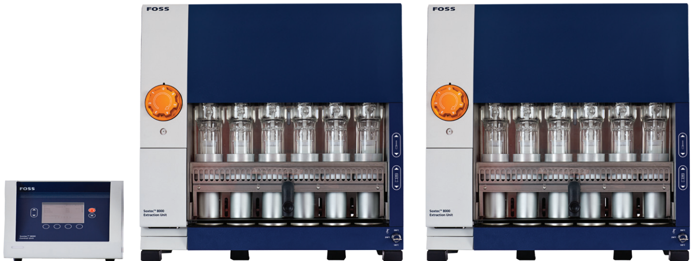
The six position extraction unit can be expanded to 12.